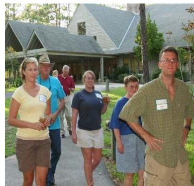
A scene from the 2006 St. Alban's Summer Retreat.