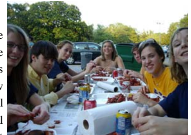
Students enjoy mudbugs and fellowship at the crawfish boil.